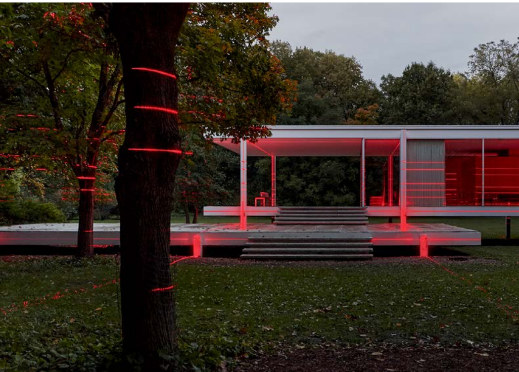
Geometry of Light , light and sound art installation at the Farnsworth House, 2019

Twenty years ago we met at the performance art department at The School of the Art Institute of Chicago where we soon discovered a shared interest in transforming spaces by means of light, color, projection and sound. Luftwerk studio was founded with an interdisciplinary approach to art where we experiment with a spectrum of materials, textures and techniques. Our practice is focused on the context of a site and its surroundings, integrating the natural or built environment, historical context, and embedded information into an site-specific immersive experience. In our recent