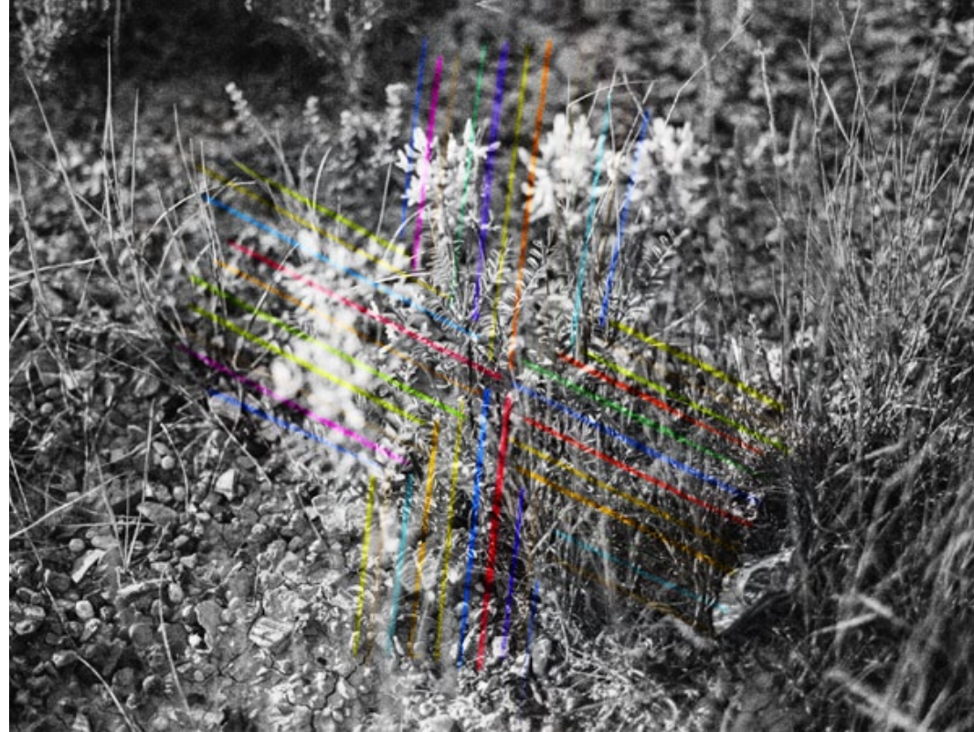
Interference (2), 2016

challenging moments, but by the end of my time there I found that my perception of space, light, sound, texture and color had shifted.