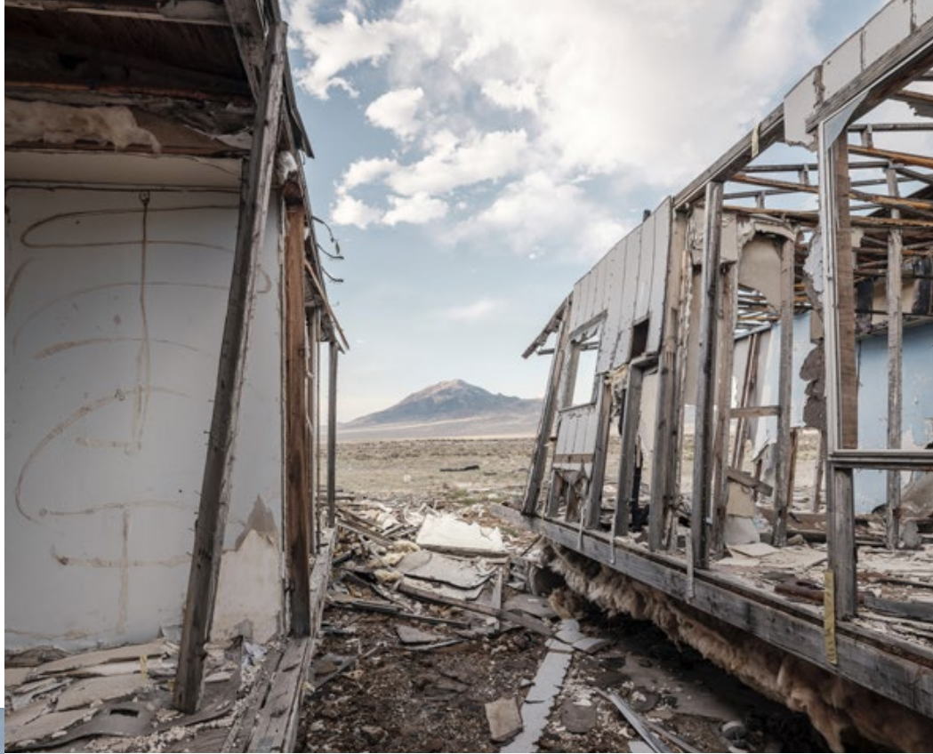
Abandoned Homes and Pilot Peak, Montello, NV, 2018

ing this story. This residency also put me in proximity to locals who were a wealth of information, oral history, and tips on pursuing my creative research.