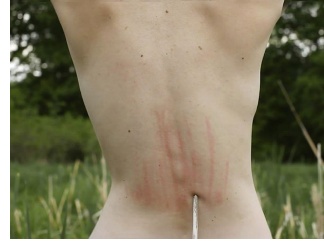
Untitled photograph from the Reed Drawing on Back performances, 2015

despite growing up in a place famed by water (Niagara Falls, Canada), I gravitate towards the land. I spent my youth playing on the fringes of well-manicured backyards, enchanted by the damp, fragrant, early-morning forest floor, the light play on the silver dollar surface of the Lunaria, the smudge of a magenta wildflower. My process draws heavily on these formative years. As an adult, my approach to art-making reflects this element of childsplay. I embrace a sense of curiosity (grass imprints on my knees, dandelion stains on my arms), wonderment, and tenderness coupled with an agenda to dismantle the theory that nature is inexhaustible, self-renewing, and ever bountiful, something independent and apart from us.