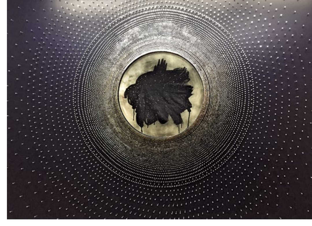
That These Things Take Time, 2018

a means through which we might exercise our muscles of empathy, humility and wonder, returning to our lived environment with those merits that much closer to the surface.