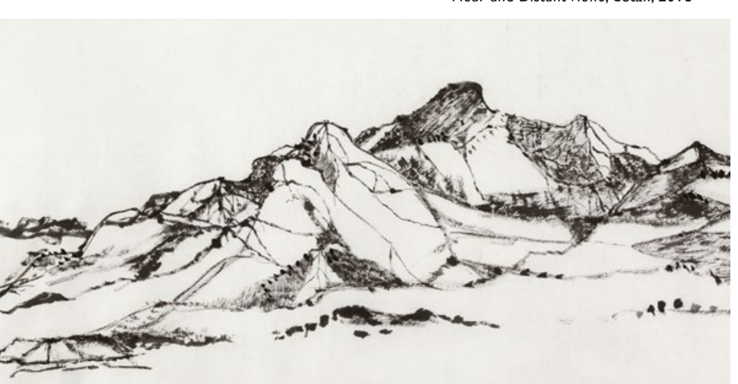
Near and Distant Views, detail, 2018

Starting each day tramping hills and gullies through juniper and sagebrush to watch the sunrise, I devoted mornings to the library situated conveniently near the bed. Each volume traced ways humans engage and cultivate the wild: national parks, land art, scientific research, white-water rafting, even advice for picking sagebrush on a full moon. My work responds to its immediate surroundings as scroll paintings do, balancing feeling and perception in sensory, even imaginary space. Manhattan's artifice requires wallpaper