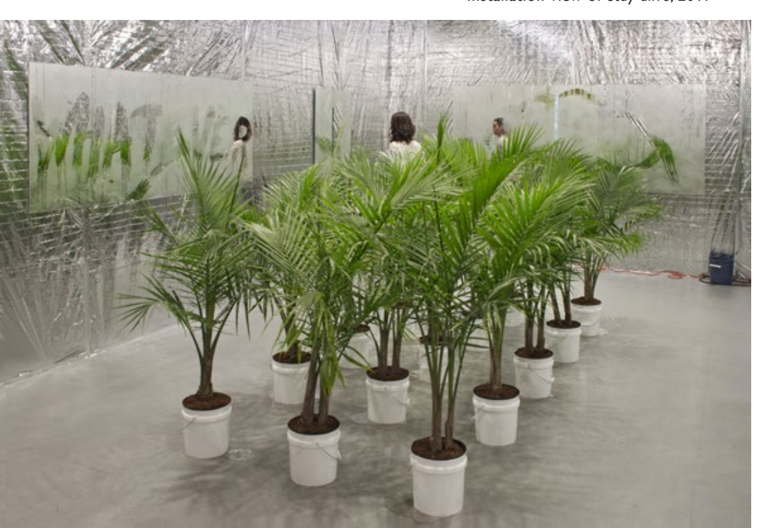
Installation view of Stay alive, 2017

I approach the work as a terrain for staging visceral, philosophical movements