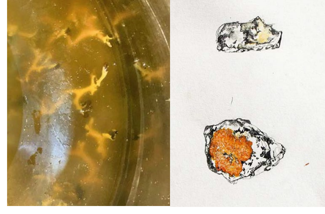
xanthoparmelia dye extraction